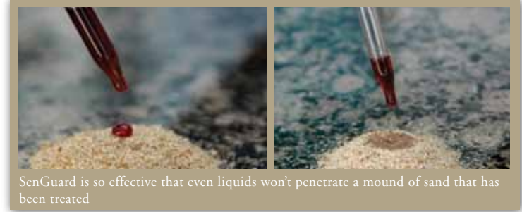
SenGuard is so effective that even liquids won't penetrate a mound of sand that has been treated